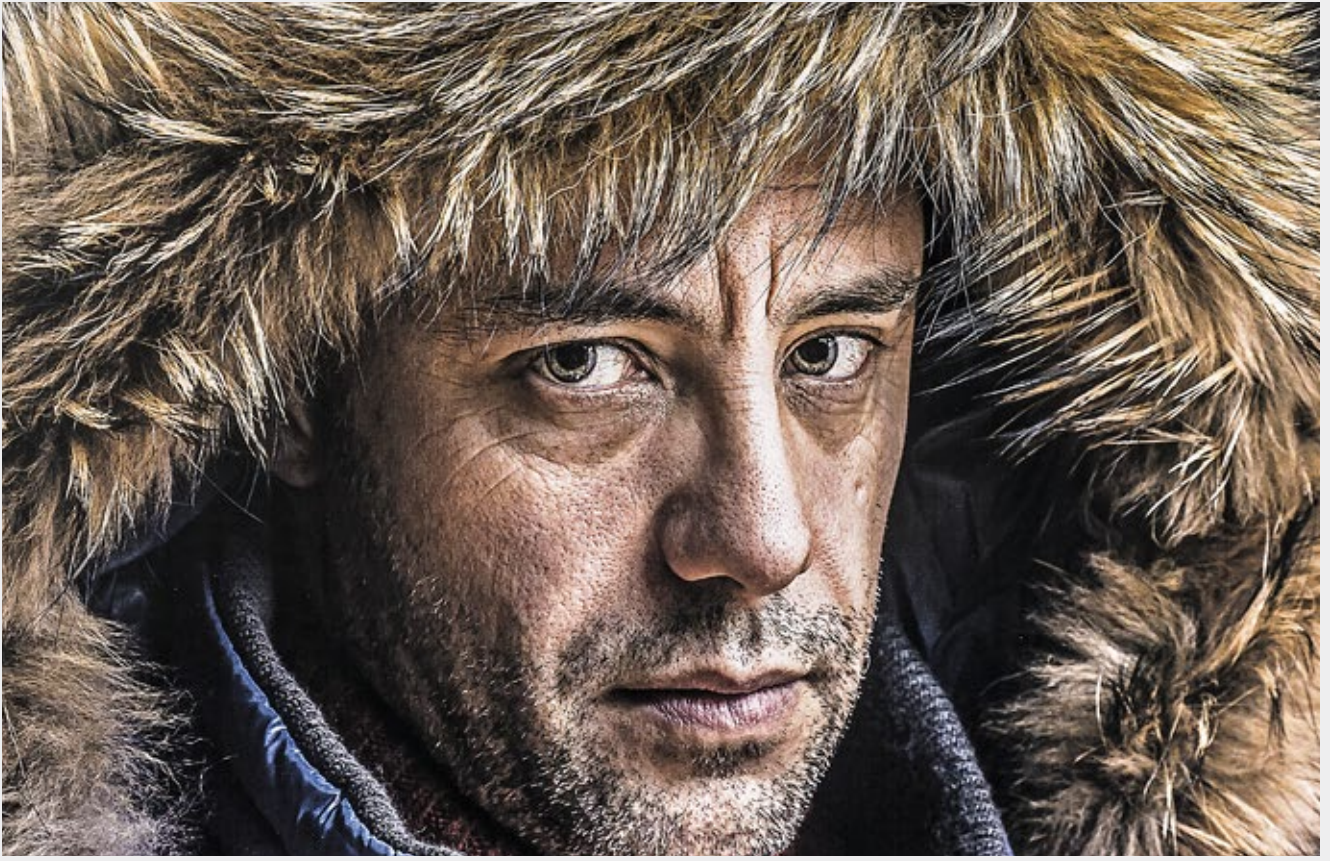
Ultra HD Resolution Technology