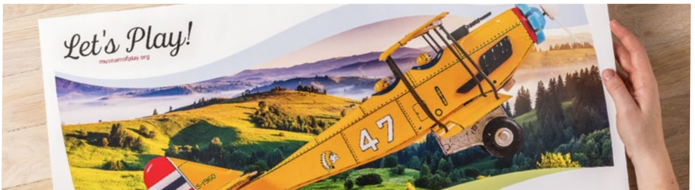
Extra-long sheet printing – maximum paper size 330.2 x 660 mm