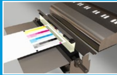
Full Width Array (FWA)

Automated Image-to-Media ensures perfect image alignment and front-to-back registration regardless of sheet size or media type – saving time and eliminating costly waste due to mis-registration or image skew.