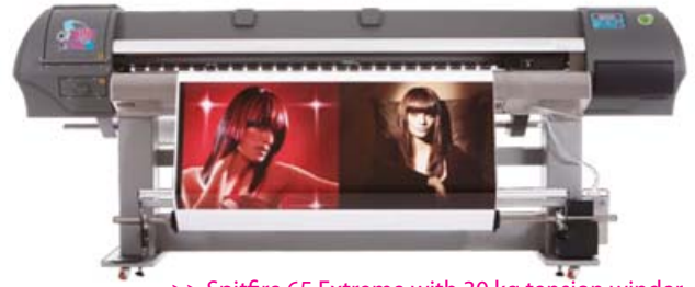
>> Spitfire 65 Extreme with 30 kg tension winder