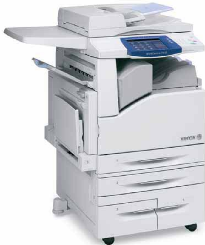
WorkCentre 7435 with Work Surface, High Capacity Tandem Tray and Integrated Office Finisher